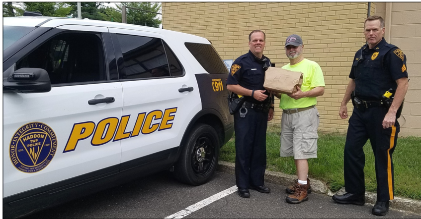
Law and order of hoagies — Santa Maria Council #1443 donated hoagies on June 26th to six local police departments who patrol in our parishes. The Council used charity raffle funds to purchase 30 hoagies that were distributed for free to local officers. The departments picked up bags of sandwiches just in time for lunch, and were extremely appreciative to the Council.